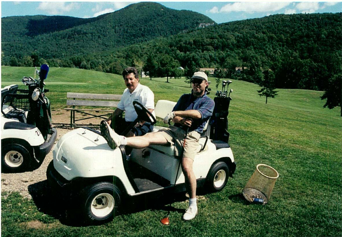
This looks like a tough day at the office !!!

To spend a fun day away from the office with friends and cohorts of the great CVC ASHRAE community.